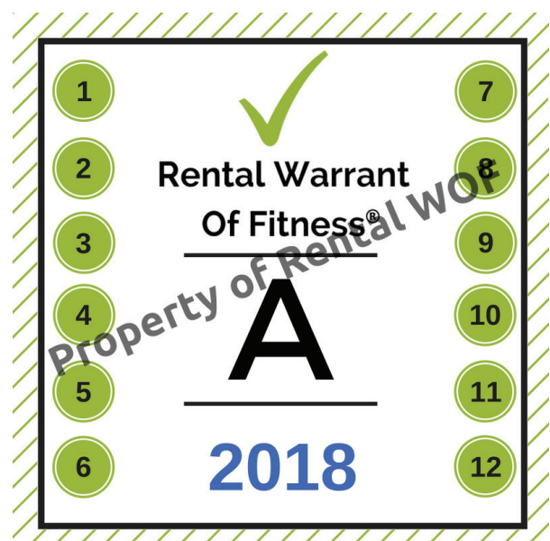
Example of the Rental WOF rating sticker.